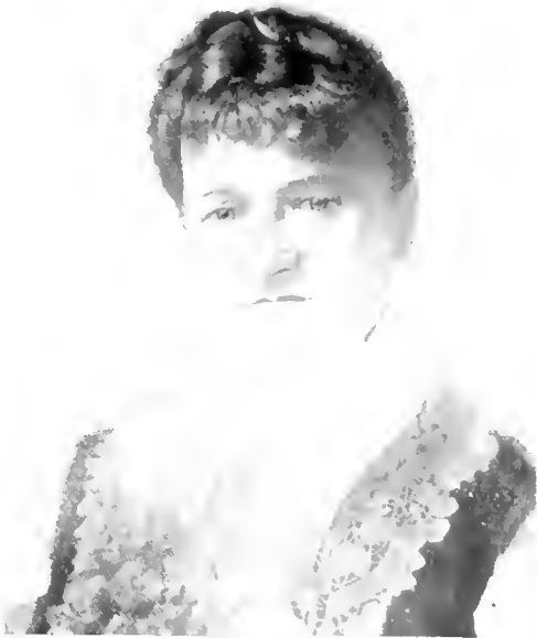
ANNA KATHARINE GREEN ROHLFS.